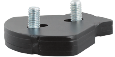
16992 fits A-series 5th wheel hitches