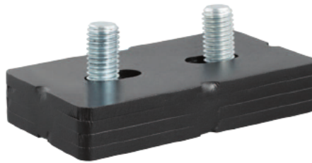
16991 fits E-series 5th wheel hitch