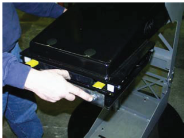
7) Put plate in location using two 9/16-12" bolts opposite corners to hold plate.