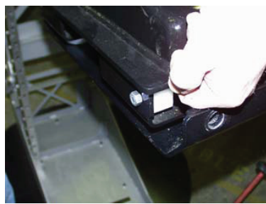
5) Install and tighten nut (self locker) x 4.