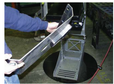
6) Slide Hijacker skid pad (making sure wedge is to rear of box) into place.