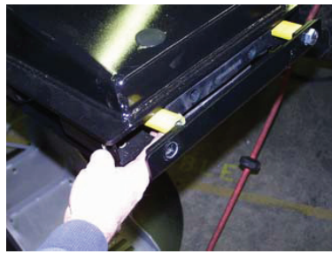
2) Push restraining rods toward center of box.