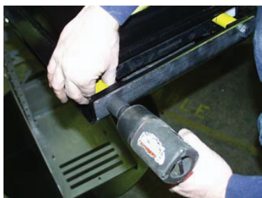
10) Tighten all 4 bolts and torque to 85 ft-lbs.