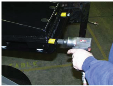
1) Remove four 9/16-12 bolts with 13/16 socket.