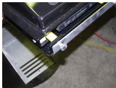
8) Align opposite corners to restraining rods.