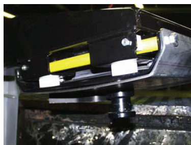
11) Completed installation.

12) Locking plates on hitch head are not needed when using this kit. They can be extended all the way out or removed.