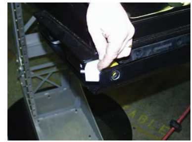
3) Slide spacer blocks into channel.