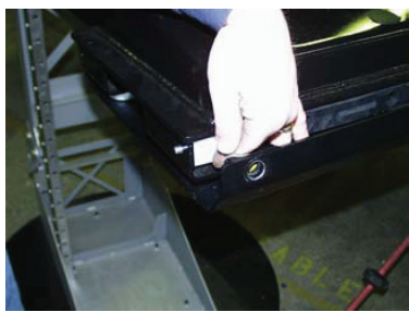
4) Install bolt through hole.