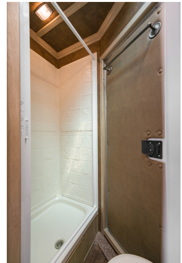
SHOWN WITH OPTIONAL FEATURES.